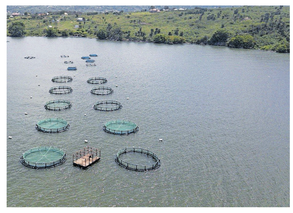
Lakeview fish cages in Lake Victoria. Pioneer farms have blazed the trail for cage farming, having demonstrated viable and replicable business models for medium and large-scale cage farming.

Building on this, the government is also directing its attention towards realising the full potential of aquaculture under the