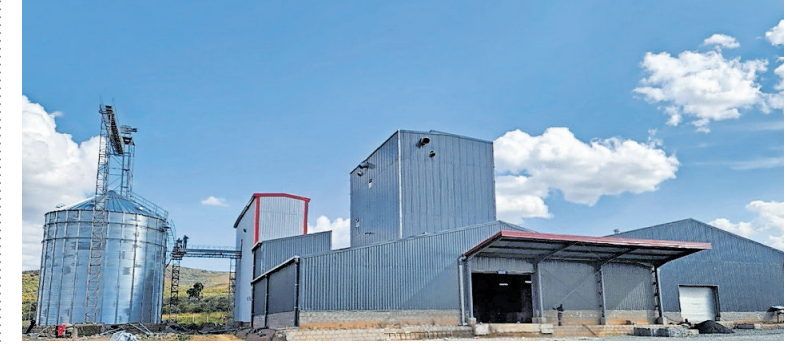
Samakgro Limited processor in Naivasha.

This is the company's strategy towards ensuring it delivers the